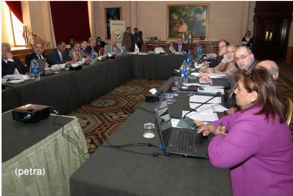
GamaLearn participation in the meetings of the Arab Network for Quality Assurance in Higher Education – ANQAHE