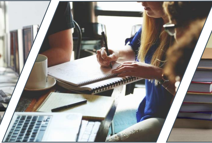
Question Bank Building